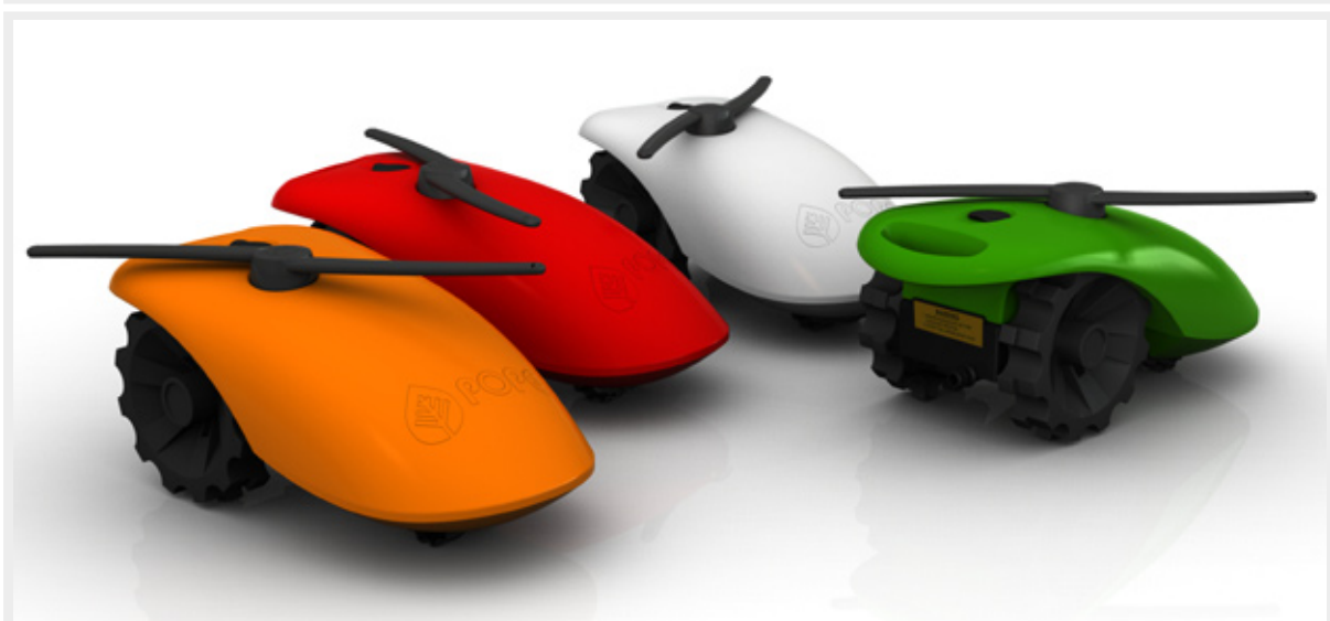
TORO Water tractor