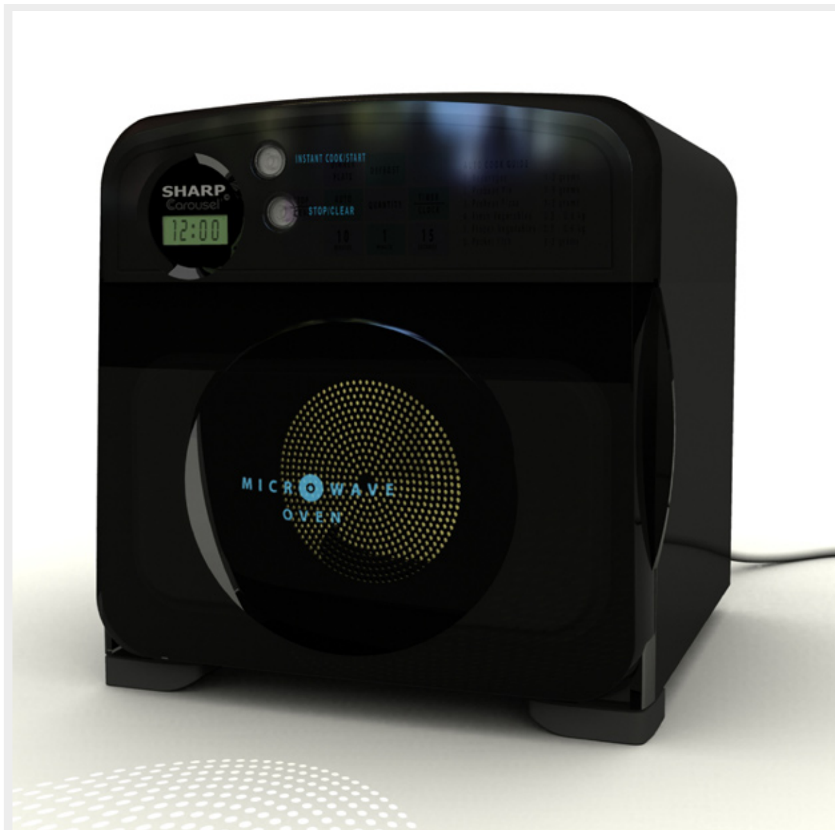
SHARP Microwave Oven

All designs, trademarks and logos are copyright of Sharp www.sharp.net.au