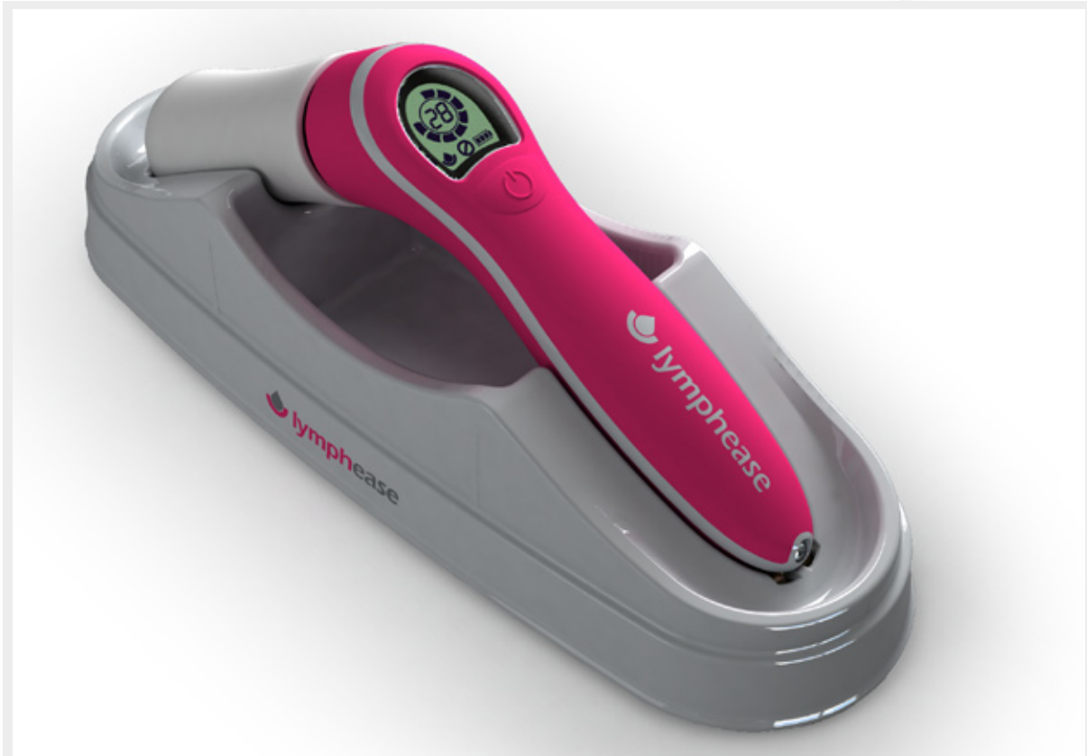
LympheaseCycloidal massage device